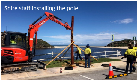
Shire staff installing the pole