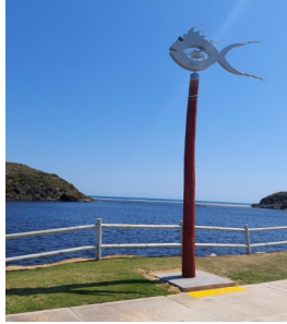
The Fabulous Fish!