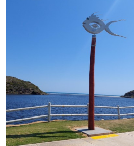
The Fabulous Fish!