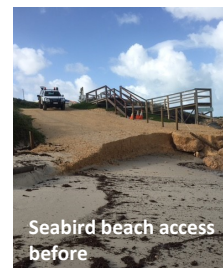
Seabird beach access before

Following several weeks of closure due to storm damage, beach access tracks in Seabird and Guilderton have been repaired by Shire staff and are now open to the public.