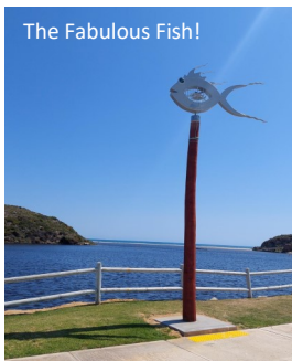
The Fabulous Fish!