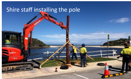
Shire staff installing the pole